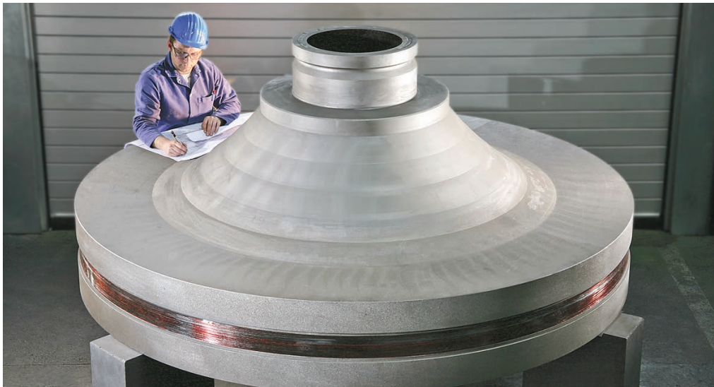
↑ Large DIABON graphite column with CARBOGUARD

Large graphite components such as column sections or tube sheets of heat exchanger can also be equipped with CARBOGUARD. Damages by overstressing can be reduced significantly especially in the toughest process conditions where risk of temperature or pressure shocks exist.