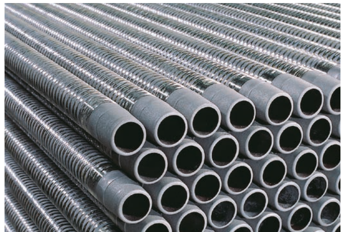
↑ DIABON graphite tubes equipped with CARBOGUARD